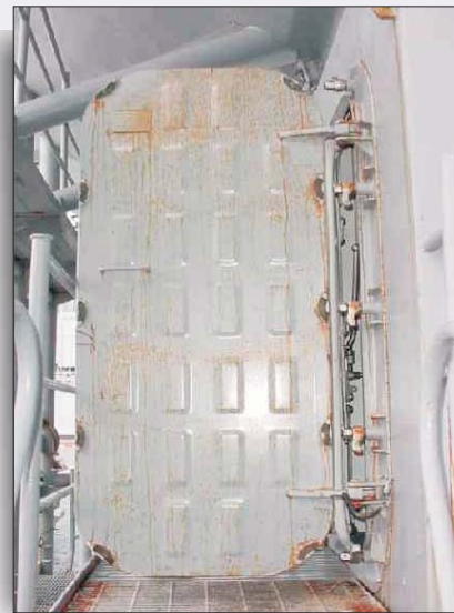
Powder coated door after a few months at sea.