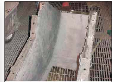
Surfaces were blasted to minimum 3 mil profile.