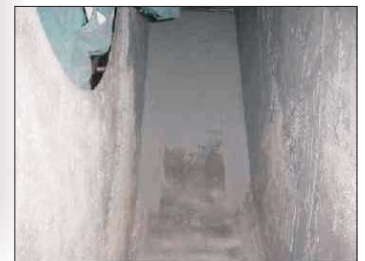
Interior was severely eroded, with many holes penetrating the walls. DurAlloy was used to rebuild all surfaces.

This stainless steel fan housing at a major mid-Atlantic wastewater treatment facility, which processes over 40 million gallons of wastewater per day, had been taken out of service due to severe erosion & corrosion damage caused by the hot, acidic exhaust gases from their incinerator which pass through this air handler.