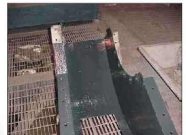
Two coats of CHEMCLAD XC were applied to all interior surfaces and flanges.