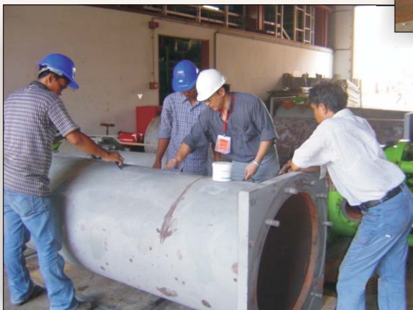
DurAlloy being applied to repair pitted areas.