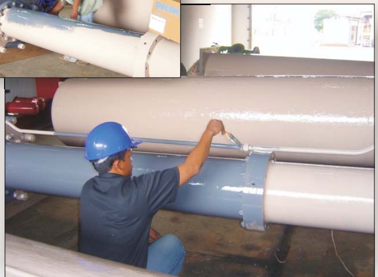
Final coat of CHEMCLAD SC being applied.

ENECON Ibérica · C/ St. Gervasi de Cassoles, 96-98 entlo. 3ª · 08022 Barcelona · Telf: 93 211.15.30 · Fax: 93.253.11.31 Website: www.proenecon.com · Email: eneconib@proenecon.com