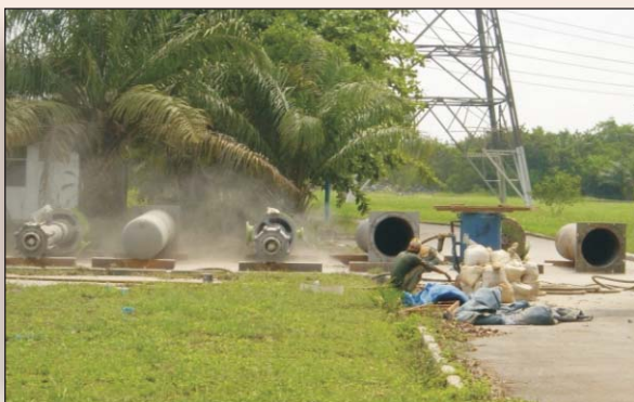
All pump sections were grit blasted.

The entire project was completed in just five days.