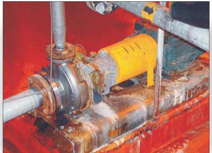
Pump base before application of CHEMCLAD XC.

The Dealer recommended CHEMCLAD XC to protect these pump bases. These 'before' and 'after' photos certainly speak for themselves.