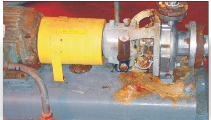
Chemical spill after pump base protected with CHEMCLAD XC.