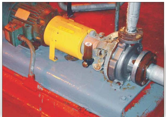
Chemical spill washed off pump base. Note: CHEMCLAD XC is in perfect condition.

ENECON Ibérica · C/ St. Gervasi de Cassoles, 96-98 entlo. 3ª · 08022 Barcelona · Telf: 93 211.15.30 · Fax: 93.253.11.31 Website: www.proenecon.com · Email: eneconib@proenecon.com