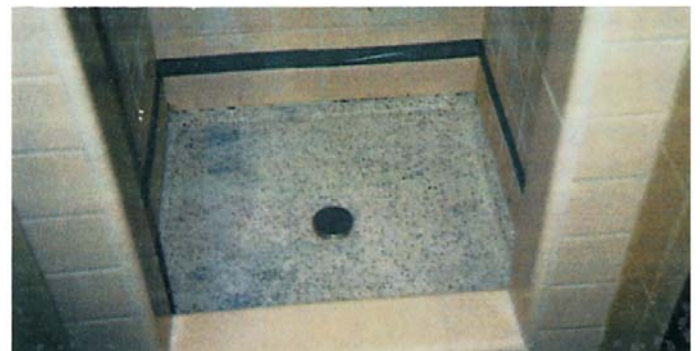
After all the surfaces to be protected are primed, the ENECRETE DuraQuartz application begins.