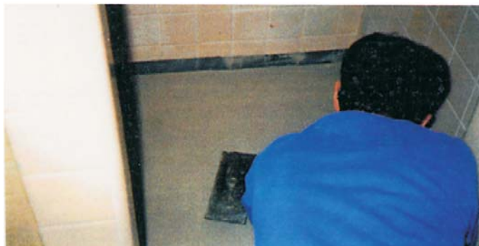
A simple trowel is all that's needed to apply DuraQuartz.