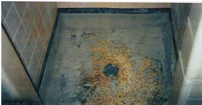
Leaking existing terrazzo shower pan. Note tape applied above the first course of tiles to neatly define the DuraQuartz repair.

The facilities engineers are delighted with the DuraQuartz repairs and intend to use it extensively throughout the university.