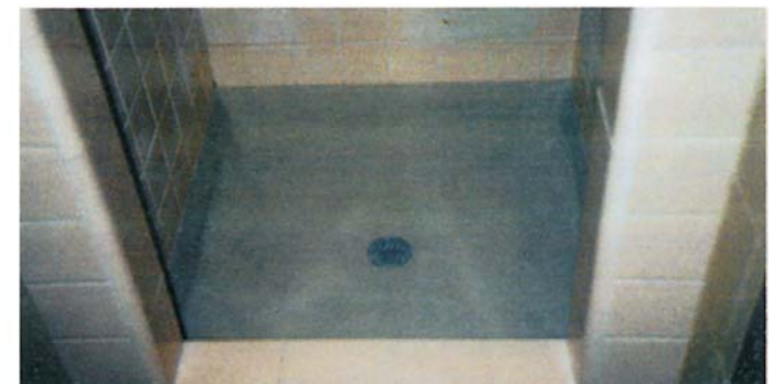
The existing shower stall beautifully finished with DuraQuartz.