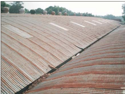
Note the holes in roof.

The factory staff no longer needs to “keep moving” during rain storms and the factory is noticeably cooler.