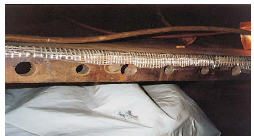
Smooth, ¼ inch thick aluminum angle coated with ENECON