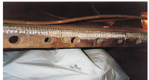
Smooth, ¼ inch thick aluminum angle coated with ENECON