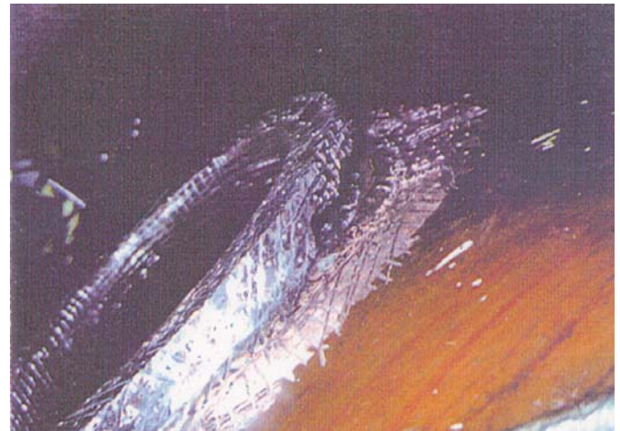
Surface prep...clean and rough!