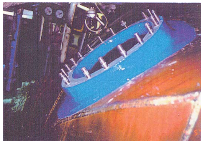
CeramAlloy CL+ provides finishing touch!

ENECON Ibérica · C/ St. Gervasi de Cassoles, 96-98 entlo. 3ª · 08022 Barcelona · Telf: 93 211.15.30 · Fax: 93.253.11.31 Website: www.proenecon.com · Email: eneconib@proenecon.com