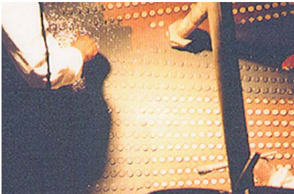
The first coat of CeramAlloy CL+ (Gray) being applied to one of the tubesheets.

$250,000 of ENECON CeramAlloy Saves Millions of Dollars Over Conventional Repair and Replacement Costs!