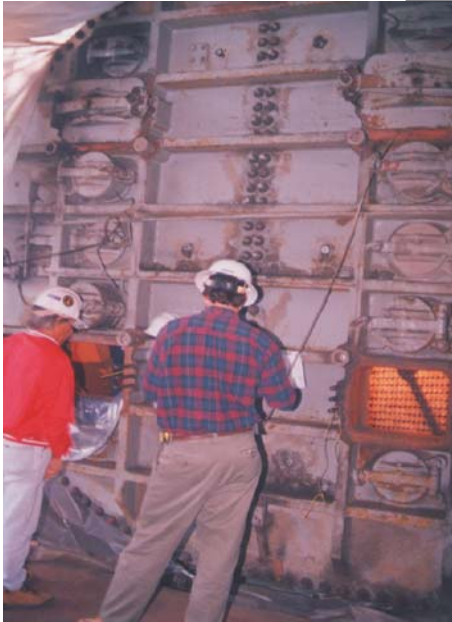
Engineers inspect one of the massive waterboxes at the power station.