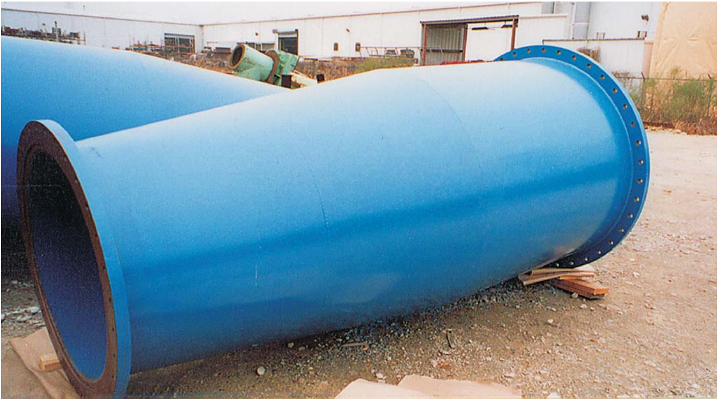
Taper Columns: CeramAlloy inside and outside.