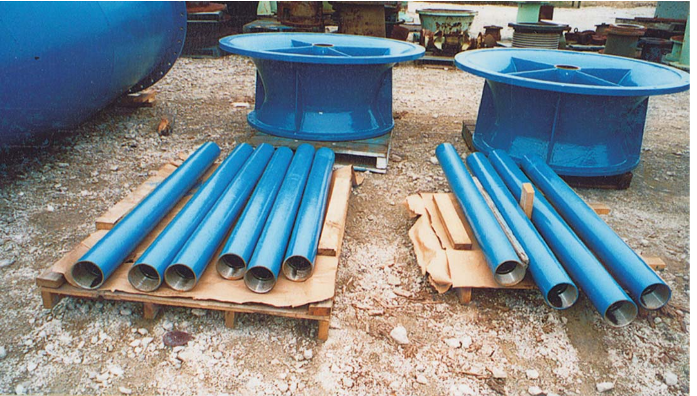
Taper Columns & Pump Heads: CeramAlloy inside and outside.