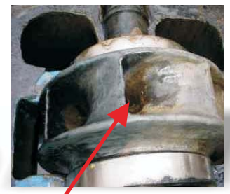
The pump impeller and bottom casing after 9 months continuous duty, showing the DuraTough DL protection of the impeller surface is still in good condition.

ENECON Ibérica · C/ St. Gervasi de Cassoles, 96-98 entlo. 3ª · 08022 Barcelona · Telf: 93 211.15.30 · Fax: 93.253.11.31