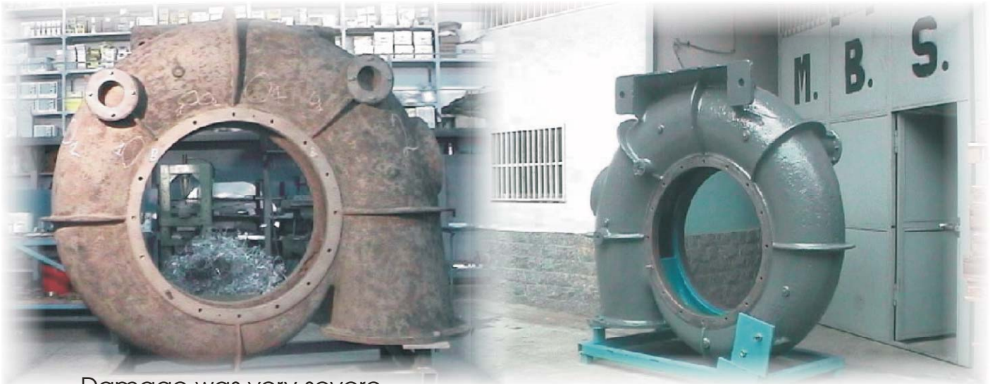
Damage was very severe