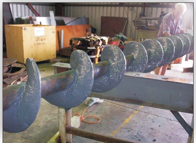
Screw conveyor protected with CBX