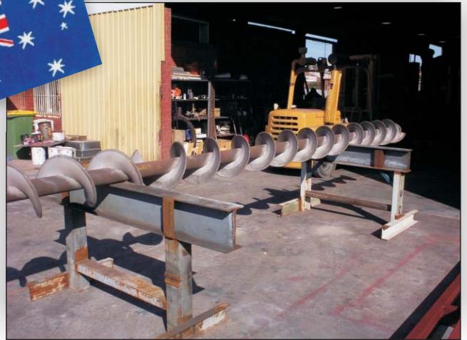
Conveyor after grit blasting