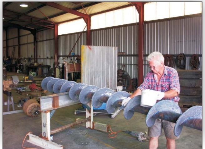
CeramAlloy CBX being applied