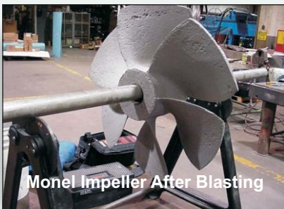
Monel Impeller After Blasting