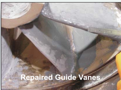
Repaired Guide Vanes