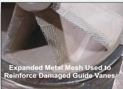
Expanded Metal Mesh Used to Reinforce Damaged Guide Vanes