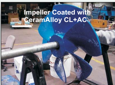
Impeller Coated with CeramAlloy CL+AC