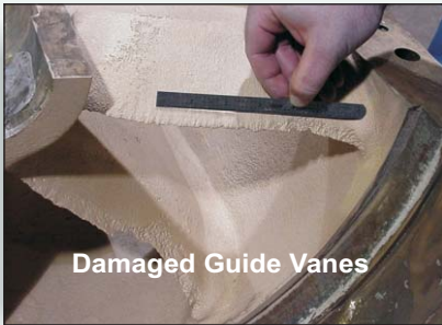
Damaged Guide Vanes