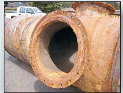
First coat applied