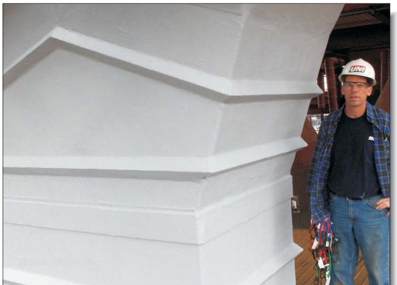
After totally encapsulating the unit in DurAlloy, ENESEAL CR was used to provide optimum corrosion resistance and a uniform look.