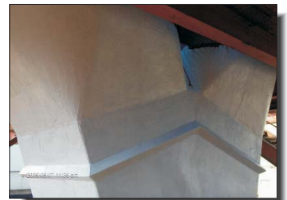
DurAlloy applied over entire extractor shell.