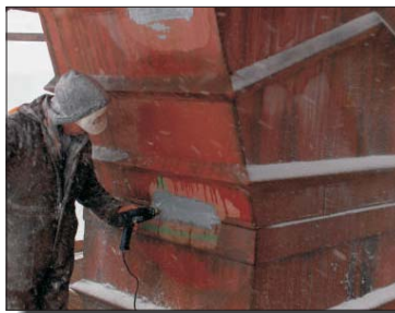
SpeedAlloy being applied.