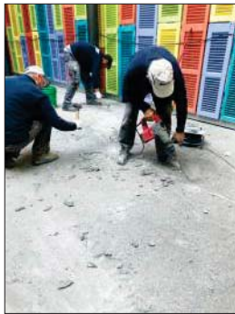
All the loose flooring material is removed