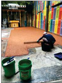
DuraFill and decorative stone is applied