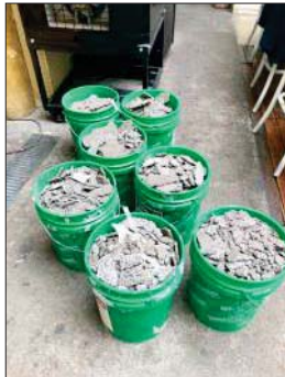
The substrate is prepared