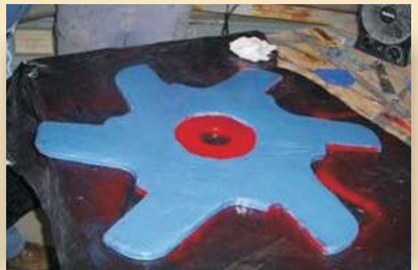
The finished wear plate.