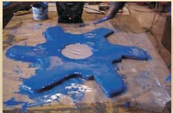
The wear plate after the application of DuraTough DL with the mold removed.