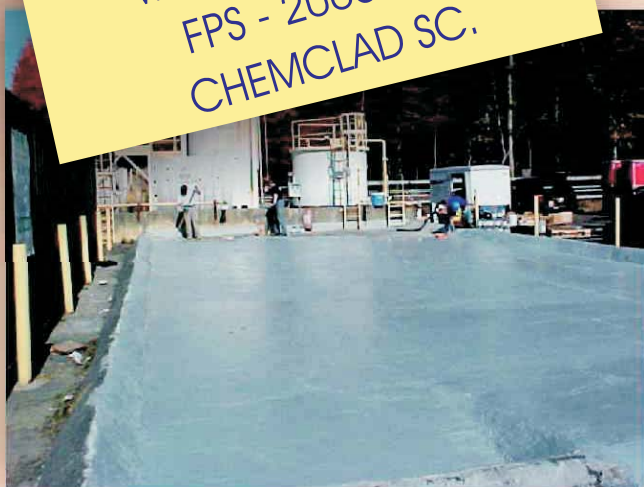
This, the largest of the three areas was first power washed, then abraded with a floor sander; cracks were repaired with ENECRETE DuraQuartz and then coated with ENECLAD FPS 2000.

This $31,000 project included three containment areas. The largest was asphalt and the other two were concrete. The asphalt had been previously coated with an epoxy paint which had deteriorated and