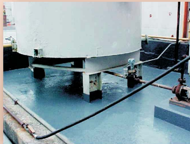
The third containment area was repaired and protected as per the second containment area.

PROENECON SYSTEMS, S.A. · C/ Electricitat, 6. Pol.Ind. La Torre · 08760 - MARTORELL. Barcelona.