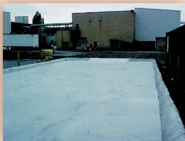
View from the opposite direction. Pallets containing drums of chemicals are stored here.

The ENECON Mid Atlantic Engineering Team completed this entire project in just 4 days to the complete satisfaction of the plant engineers.