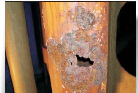
Holes caused by corrosion