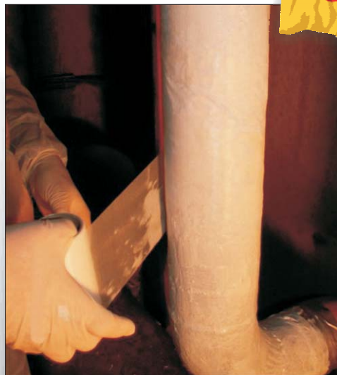
Fiberglass reinforcement tape over 1st