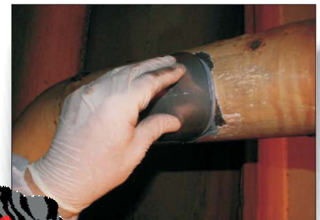
Patch applied to hole