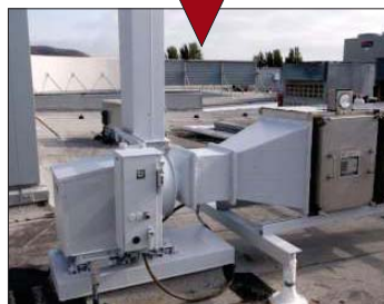
Rooftop ventilation filter station. Prepared by pressure washing the entire surface then two coats of ENESEAL® CR were applied to prevent against future corrosion.