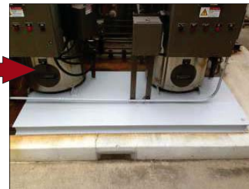
Chemical treatment process station base. Prepared by pressure washing then two coats of ENESEAL® CR.