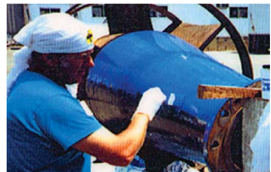
Applying CL+ to one of the diffuser components.

PROENECON SYSTEMS, S.A. · C/ Electricitat, 6. Pol. Ind. La Torre · 08760 - MARTORELL. Barcelona. · Telf: 93 211.15.30 · Fax: 93.253.11.31