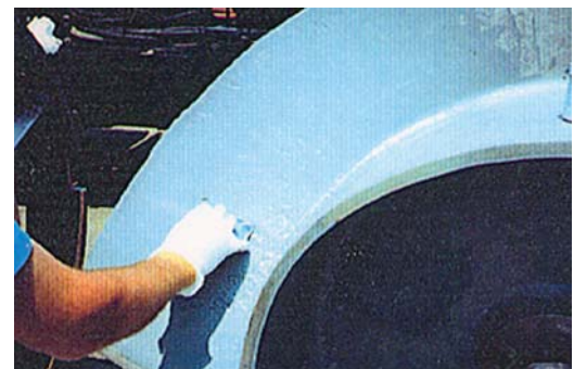
Rebuilding with CeramAlloy CP+