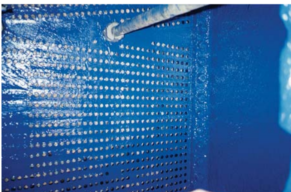
Final coat of CeramAlloy CL+ (Blue) applied to all wet surfaces to provide years of erosion/corrosion protection to the condensers.

The ENECON Engineering Team in Southern California, supervised the installation of a quarter-million dollars worth of CeramAlloy CP+ and CL+ to rebuild and resurface 8 waterboxes and tubesheets at a power station near Los Angeles.