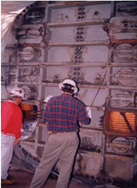
Engineers inspect one of the massive waterboxes at the power station.