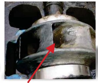
The pump impeller and bottom casing after 9 months continuous duty, showing the DuraTough DL protection of the impeller surface is still in good condition.

PROENECON SYSTEMS, S.A. · C/ Electricitat, 6. Pol. Ind. La Torre · 08760 - MARTORELL. Barcelona. · Telf: 93 211.15.30 · Fax: 93.253.11.31