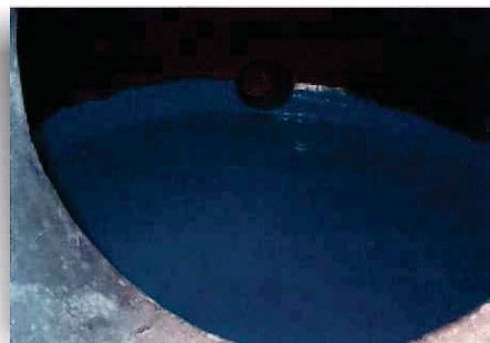
Water box repaired & coated

This $65,000 project was completed in just a few days.