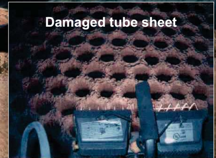
Damaged tube sheet