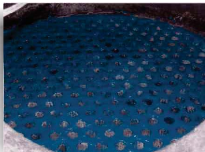
Tube sheet repaired & protected