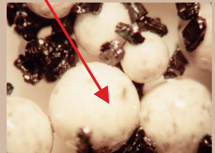
Microscopic View of CBX