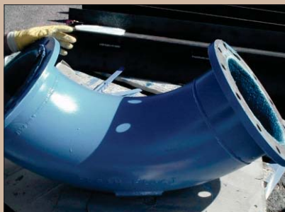
Primary Feed Spool