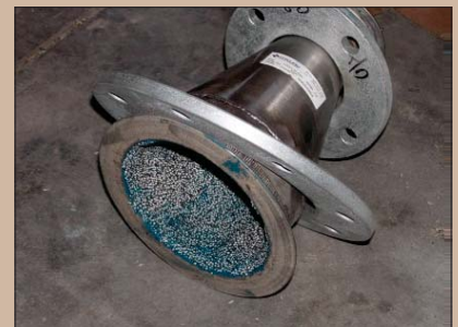
Another View Cyclone

PROENECON SYSTEMS, S.A. · C/ Electricitat, 6. Pol. Ind. La Torre · 08760 - MARTORELL. Barcelona. · Telf: 93 211.15.30 · Fax: 93.253.11.31