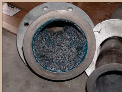
Paper Recycling Mill Cyclone