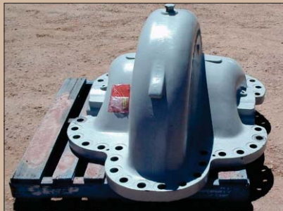
Filtrate Pump - Alumina Refinery