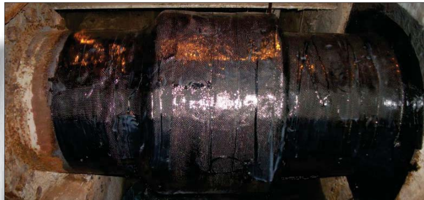
Finished DuraWrap System

PROENECON SYSTEMS, S.A. · C/ Electricitat, 6. Pol. Ind. La Torre · 08760 - MARTORELL. Barcelona.