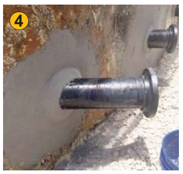
The repaired pipes and tank wall.