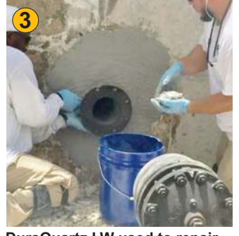
DuraQuartz LW used to repair the vertical tank wall.