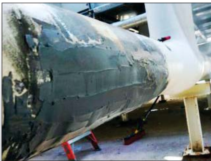
Repairs made with DurAlloy.