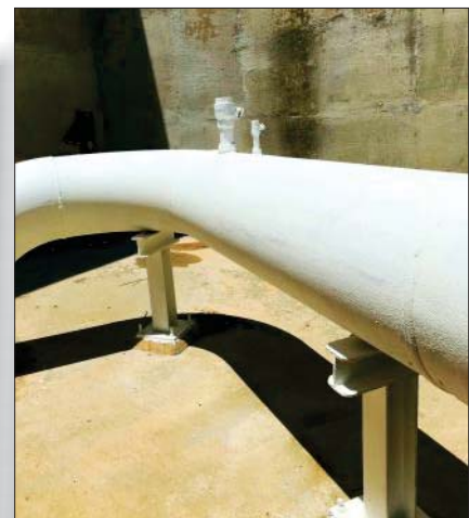
Two coats of ENESEAL CR.

PROENECON SYSTEMS, S.A. · C/ Electricitat, 6. Pol. Ind. La Torre · 08760 - MARTORELL. Barcelona.