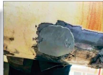
SpeedAlloy QS stops the leaks.